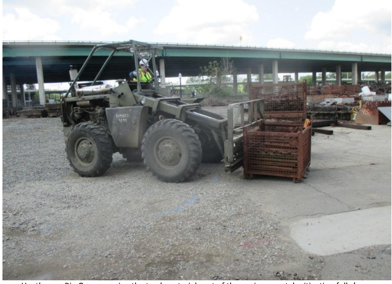
Heather on Big Green moving the track materials out of the environmental mitigation folks' way