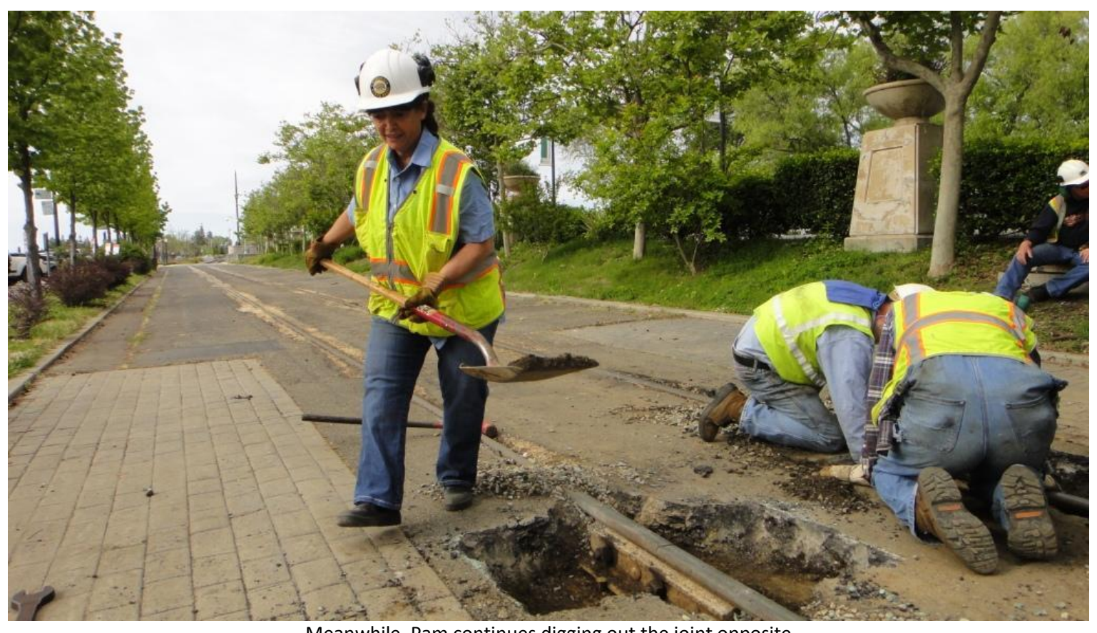
Meanwhile, Pam continues digging out the joint opposite