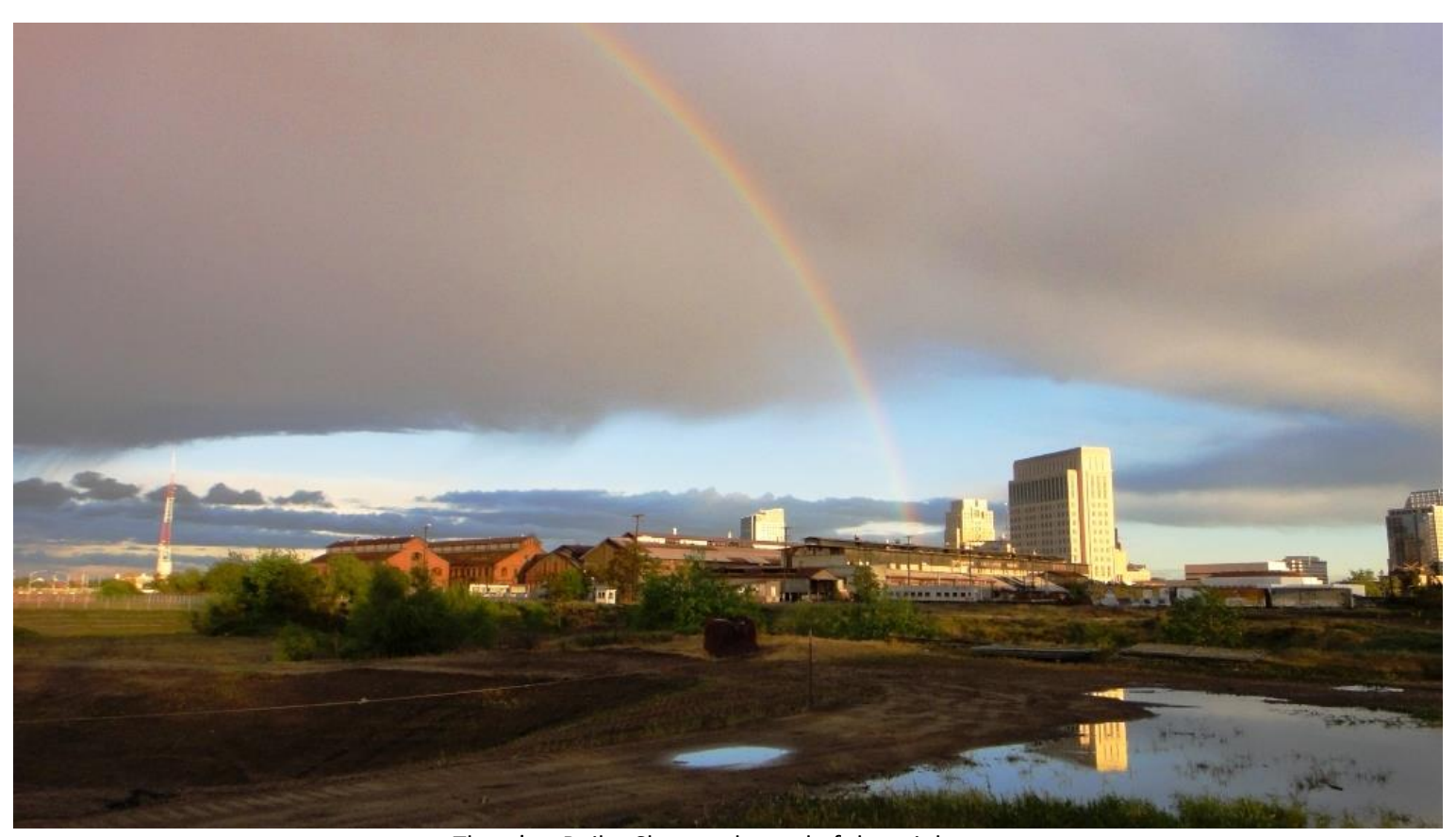
There's a Boiler Shop at the end of the rainbow...