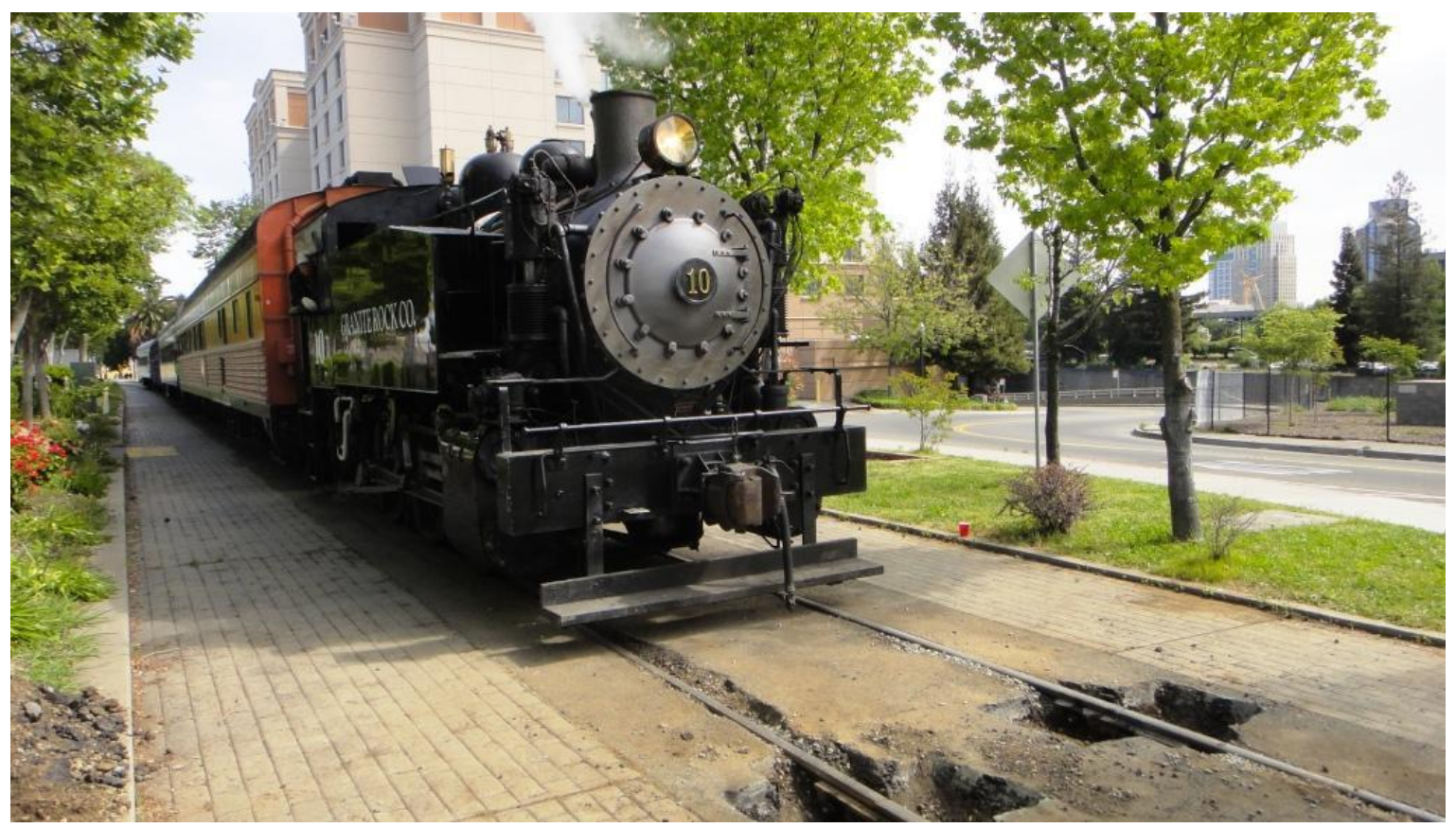
"Granite Rock 10 has permission to pass red-flags located at Mile Post 0.3 and Mile Post 0.6 without stopping, over..."